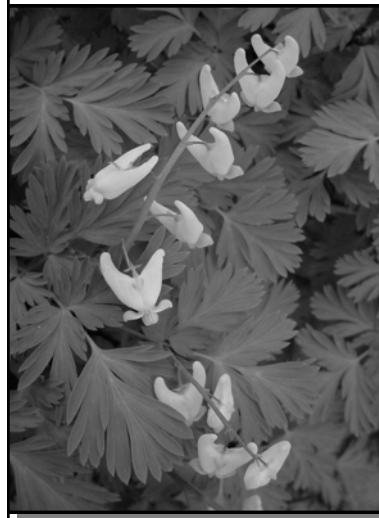
Dutchman’s Breeches

Wild Columbine ( Aquilegia canadensis ): The name “columbine” comes from the Latin columba , “dove,” due to the “resemblance of its nectaries to the heads of pigeons in a ring around a dish.” One explanation for its genus name, Aquilegia , comes from the Latin, aquila , “eagle,” since the spurs of the five scarlet and yellow cornucopia-like petals resembled eagle talons. According to the Victorian language of flowers, columbine is the symbol of folly - the flower’s shape is reminiscent of a court jester’s cap and bells.